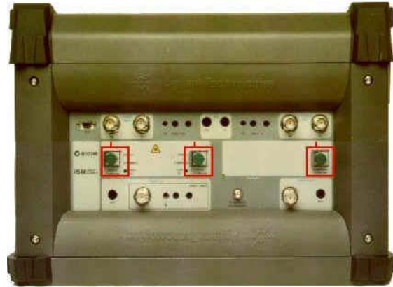
New Top Panel